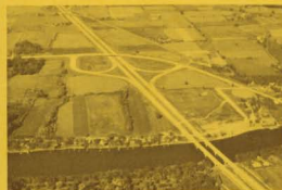
Twin bridges carry I-90 over Rock River just south of interchange with Highway 59 between Edgerton and Milton Junction.