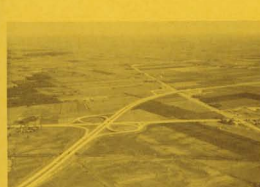
I-90 swings southward through interchange with Highway 26 between Milton and Janesville. Triangle is completed at right center by U. S. 14.