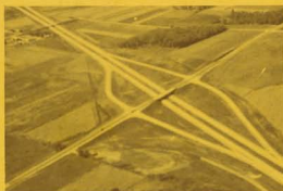
County Trunk Highway "N" overpasses I-90 at interchange between Cottage Grove and Stoughton.