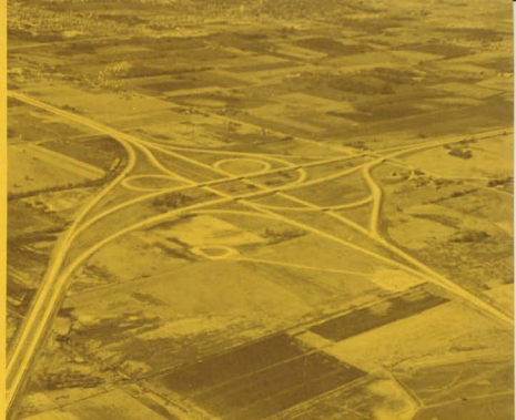
Interstate 90 proceeds from south (left) to north through interchange with U. S. 12-18 near Madison. U. S. 51 overpass at 12-18 is visible in upper left background, with Village and Lake Monona upper center.