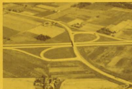
Dual-purpose interchange serves to merge U. S. 51 (lower right) and Highway 73 (from upper left) with I-90 near Albion. Highway 106 from Fort Atkinson approaches junction with S. T. H. 73 at top left.