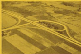
Trumpet interchange carries U. S. 51 on and off I-90 east of Stoughton.