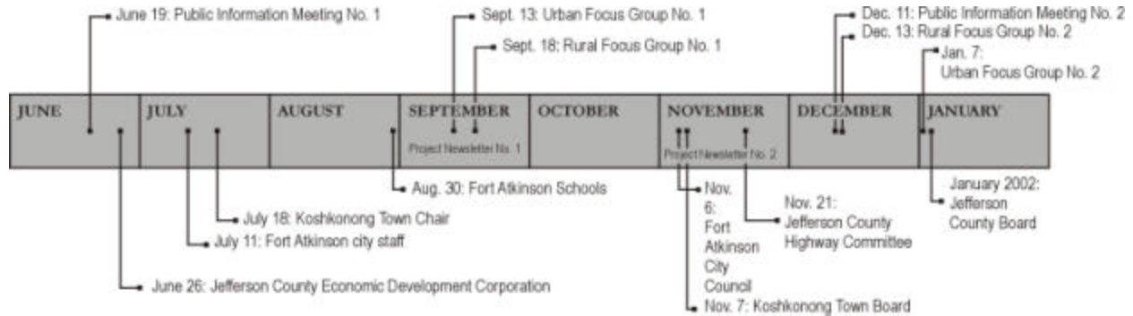
Exhibit 2: Time Line of the Study's Public Involvement Process

In addition, a public survey was conducted by St. Norbert College to gather statistically valid information from Fort Atkinson and Koshkonong residents selected at random regarding transportation needs along the US 12 corridor. The survey methodology featured: