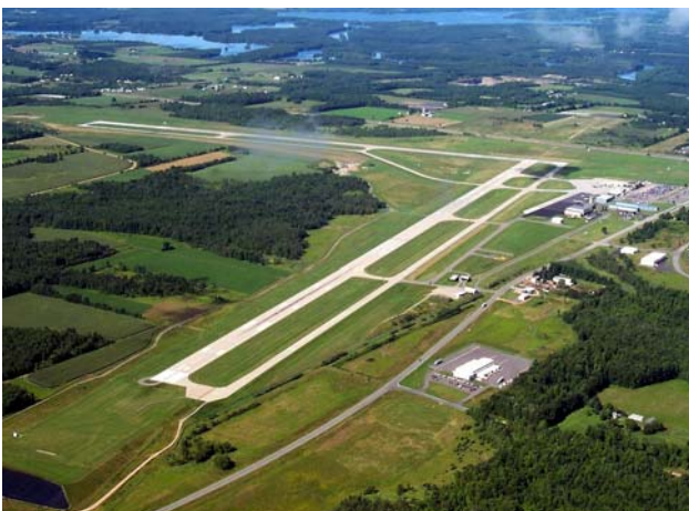
Central Wisconsin Airport

A study by the Wisconsin Department of Transportation (WisDOT) showed that between 1997 and 2001, over 85 percent of new or expanded manufacturing businesses were located within 15 miles of an airport capable of handling jet aircraft. These manufacturers provided 34,064 jobs for Wisconsin residents.