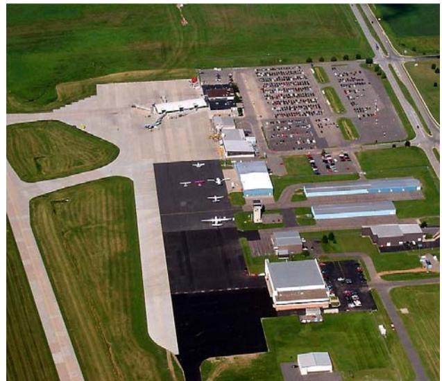
Central Wisconsin Airport

This report has identified and quantified the economic contribution of Central Wisconsin Airport's 2006 activity to both the local economy and the State of Wisconsin.