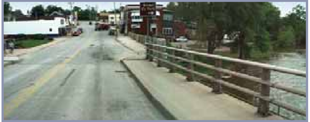
Photo simulations of two potential views of WIS 96 Fox River bridge looking east from same location as above