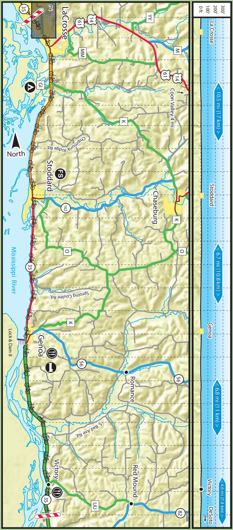
* Below is an elevation view of the route. Horizontal lines represent 100 feet in elevation change and correspond to the elevation of that point on the route. Vertical lines represent 1 mile distances along route.